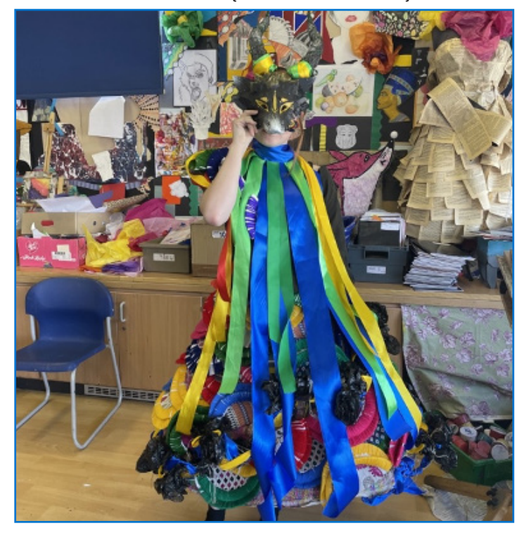
We are extremely proud of our students, and wish them all the luck for the competition.

Two Year 10 students have been very creative to design and make an astonishing dress, to secure a place in the UK finals which will take place on Thursday 19th May. Junk Kouture will be awarding 10 winners from the live final this year, with the chance of winning tickets to the first ever world final in an exciting location yet to be announced, and compete for the Junk Kouture world title against four other cities including: Dublin, Paris, Milan and New York, and the UAE (United Arab Emirates).